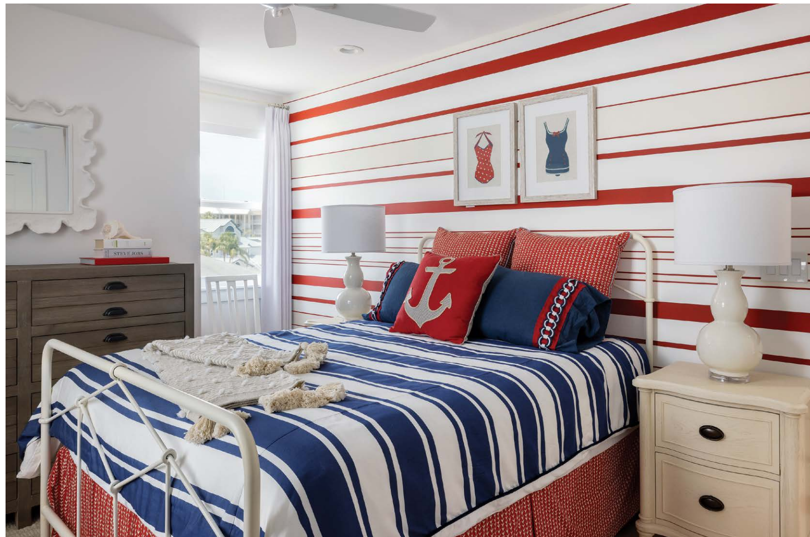
ABOVE: Nautical red, white, and blue details in a guest bedroom nod to the home's beach address. BELOW: A black-and-white palette denotes casual elegance in the primary bathroom.