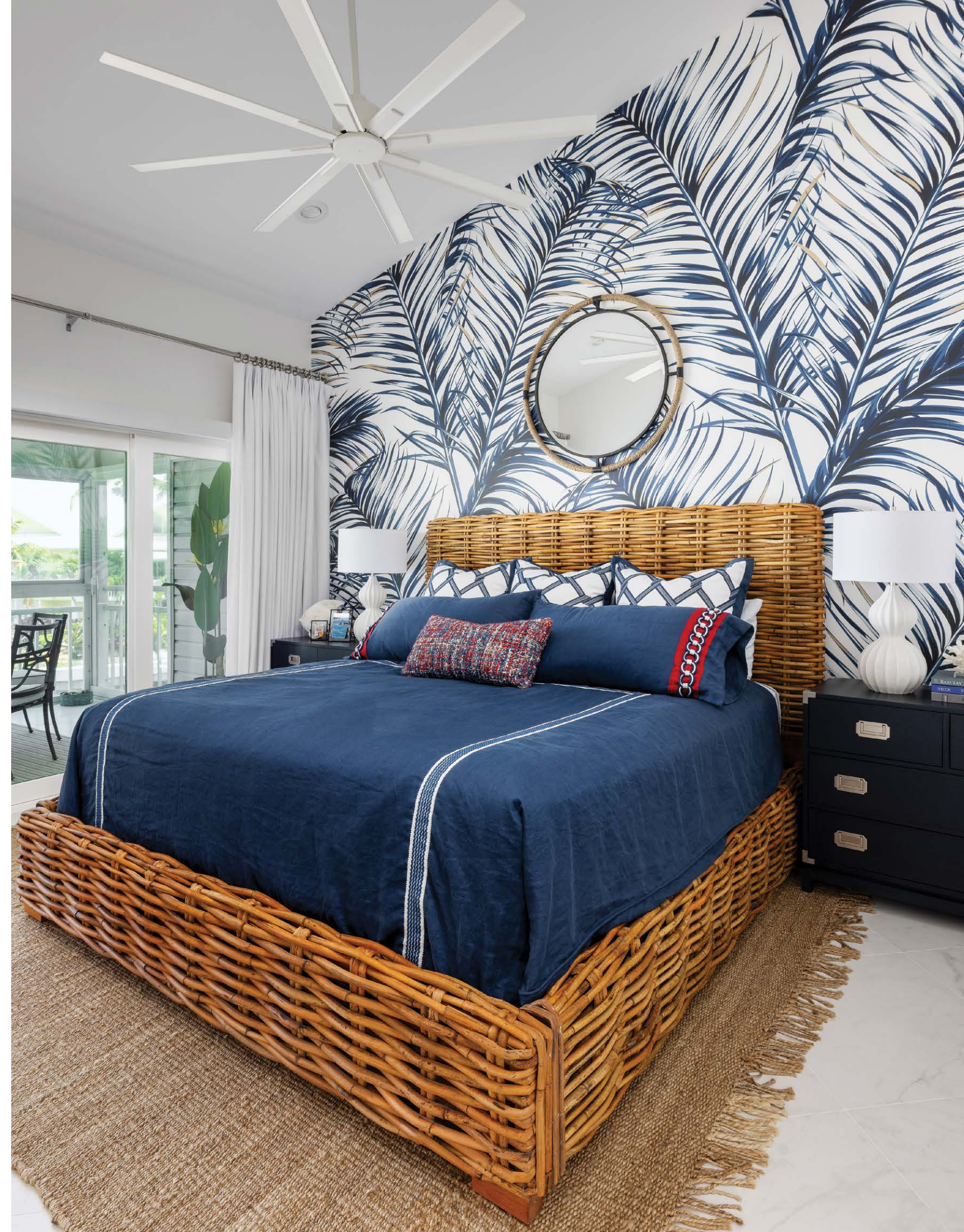
RIGHT: In the primary bedroom, a wicker-frame bed and a bold palm tree mural solidify the coastal vibe of the interior design. The lanai balcony easily accommodates six.